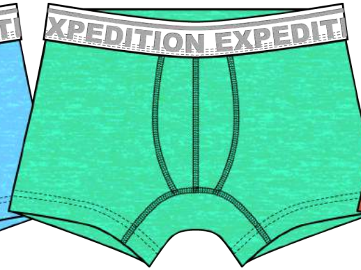
C. HEATHER GREEN GLOW