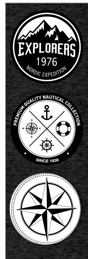
CLOSEUP OF EXPEDITION PATCHES