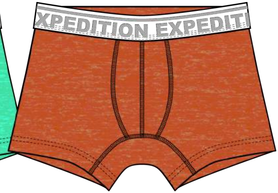
D. HEATHER ORANGE