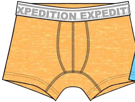
A. HEATHER GOLD