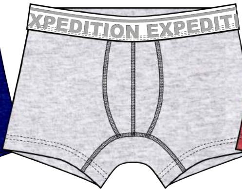
F. HEATHER LT GREY