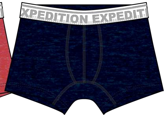
H. HEATHER MIDNIGHT

WHATEVER COLOR YOU PICK, OUR BOXER SHORTS ARE MADE FROM SMOOTH COTTON-BLEND THAT FEELS SOFT AND COMFORTABLE.