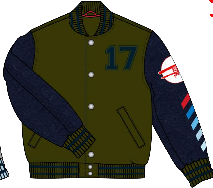
B. GRASSMARK GREEN

MILITARY STYLE MEETS DENIM COOL WITH THIS TEXTURE MIX BOMBER JACKET. THIS CONTRAST PATCH DESIGN WILL BOOST ANY OUTFIT.