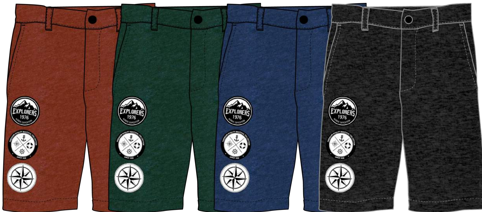
A. HEATHER RUST