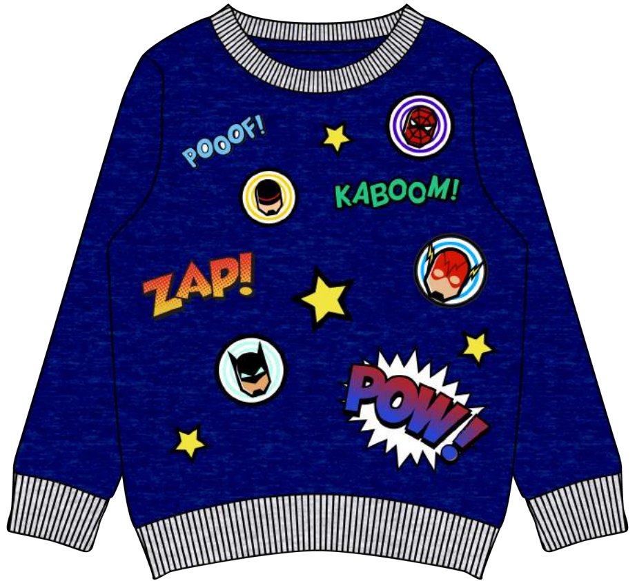
B. DYNAMO BLUE

HEAD TO THE TREEHOUSE WITH THIS ACTION-PACKED PULL-ON SWEATSHIRT, FEATURING COMIC BOOK PATCHES.