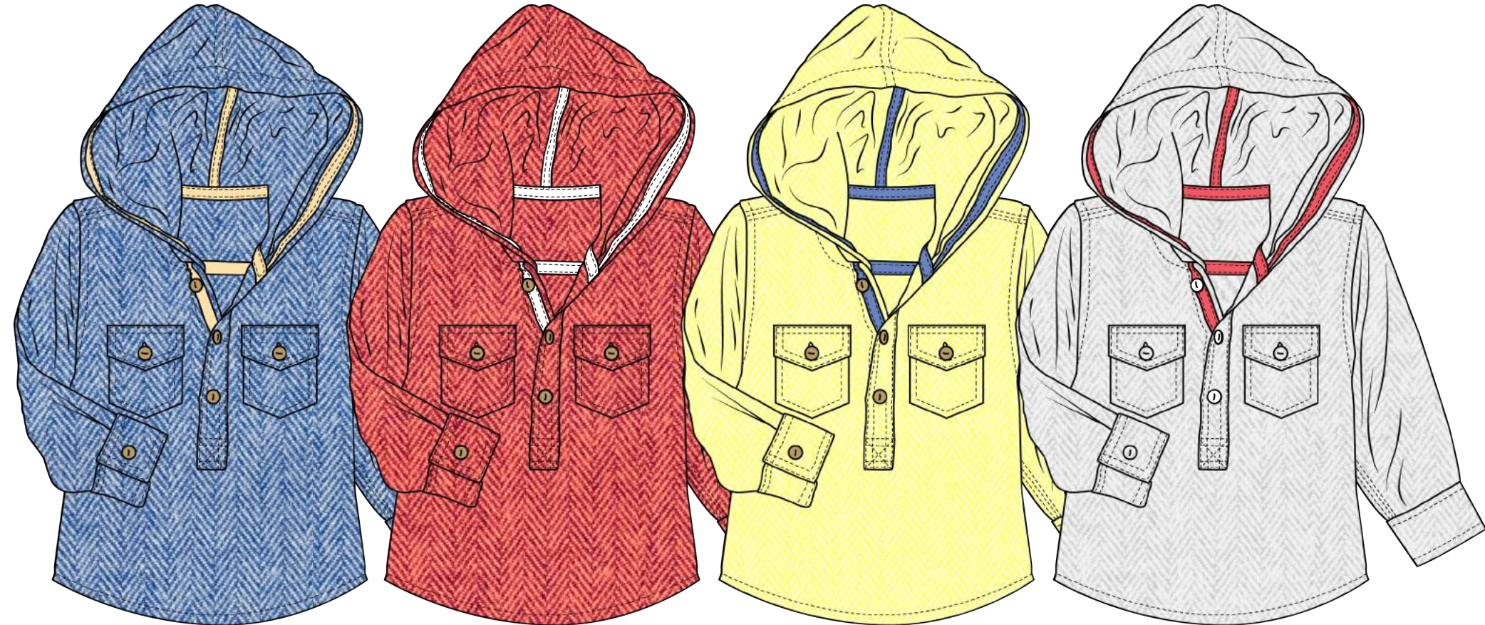
A. BEACH BLUE