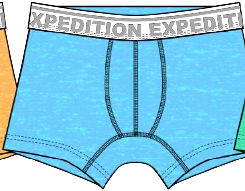
B. HEATHER SKY BLUE