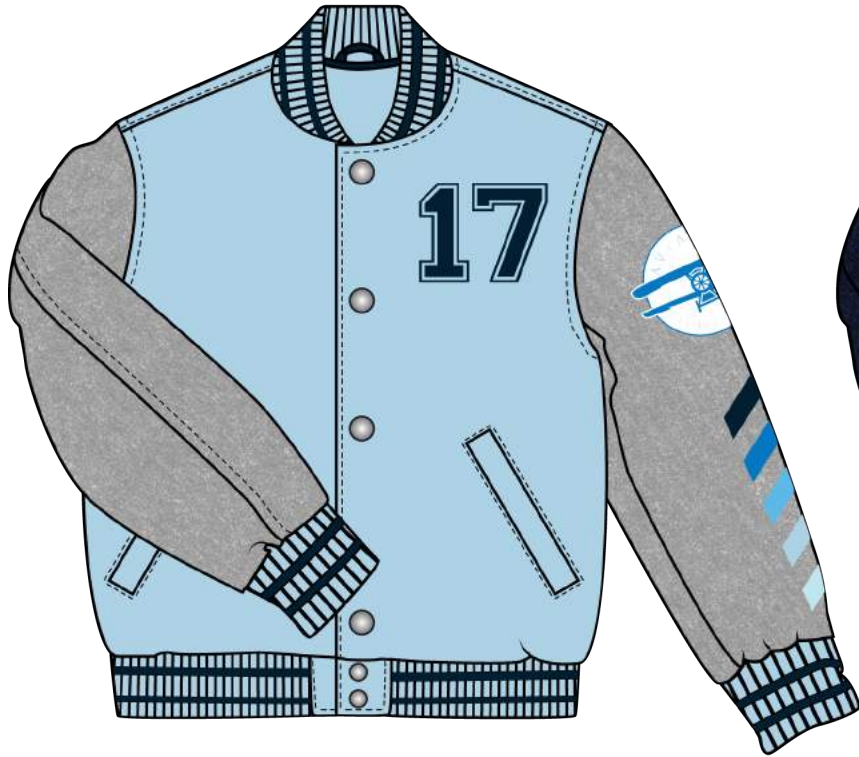
A. DAY BREAK BLUE