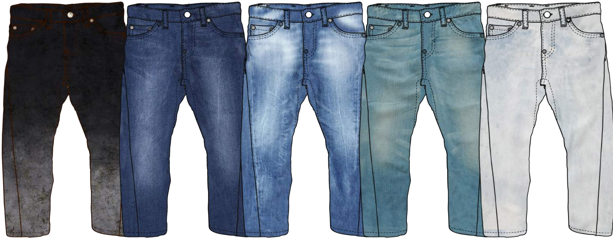
A. BLACK OMBRE WASH