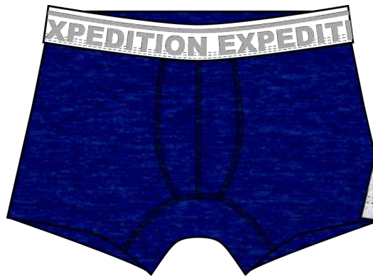
E. HEATHER ROYAL